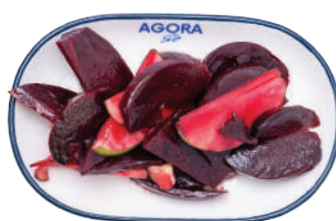
APPLE & BEETROOT SALAD