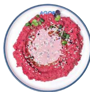
HUMMUS WITH BEETROOT