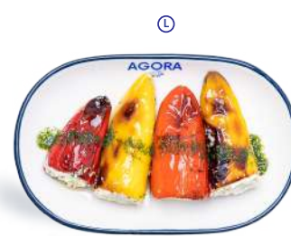
STUFFED BELL PEPPERS